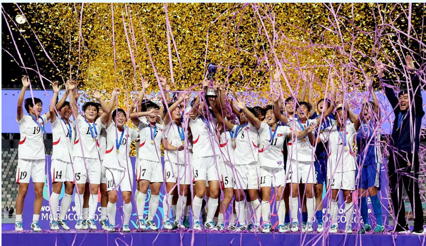
DPRK women footballers celebrate after winning the 2025 FIFA U-17 Women's World Cup.

The DPRK sportspersons with disabilities also achieved successes in international games