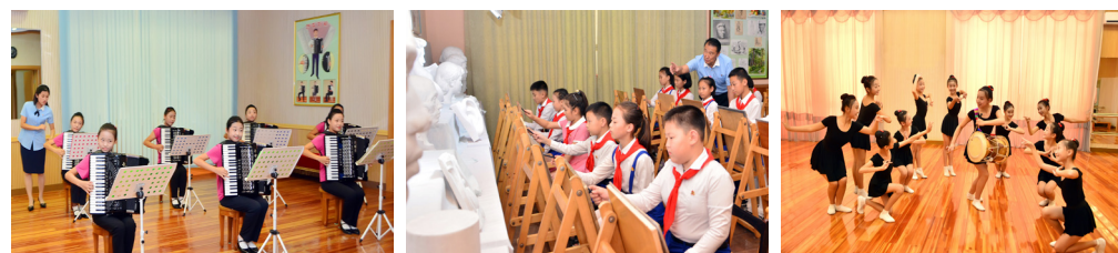
At the Mangyongdae Schoolchildren's Palace.