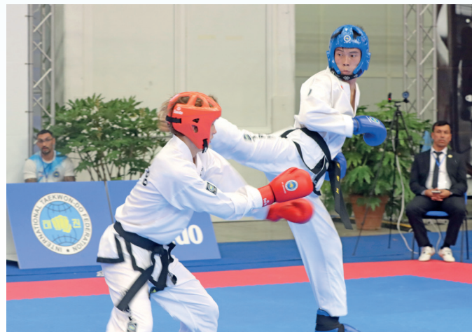
A scene of a men's individual sparring match at the 23rd Taekwon-Do World Championships.