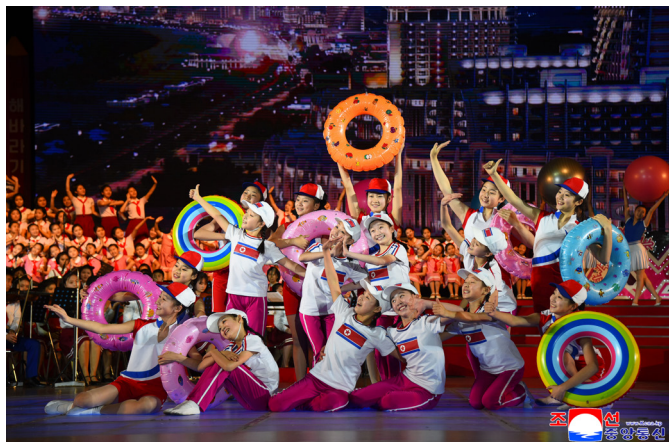
Scenes from the performance of schoolchildren for greeting the New Year 2026 "My Country Is the Best".