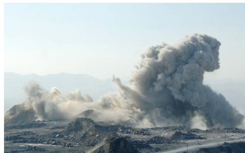
The Sunchon Limestone Mine carries out a 200 000-cubic-metre blasting.