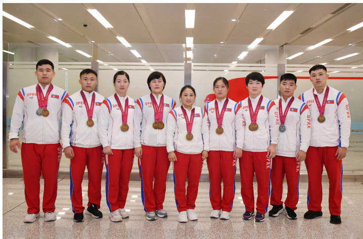
DPRK medalists at the 2025 International Weightlifting Federation World Championships.