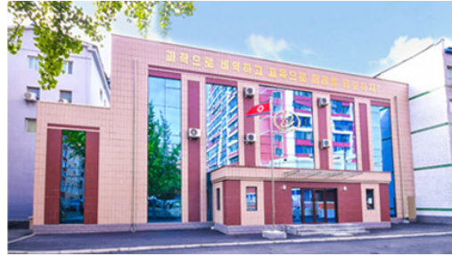
The newly built Pyongyang Municipal Education-support Program Centre.