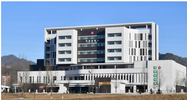
The Kangdong County Hospital.

In addition, many medical workers and researchers of the Pyongyang General Hospital,