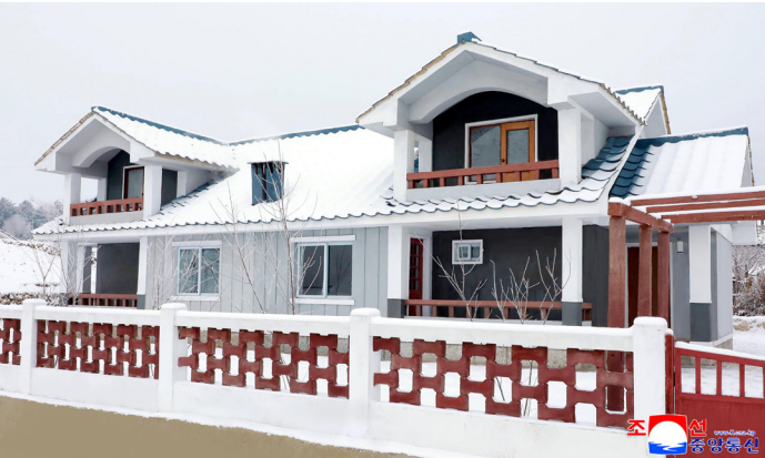
New rural houses built at the Pobu Farm in Kaechon City, the Phungthan Farm in Sunchon City and in Thaephyong-ri of Hyangsan County.