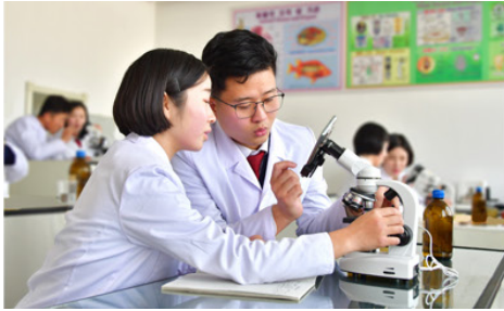
At the life science experimental education centre of Kim Il Sung University.