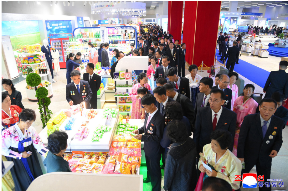
A scene of a light industrial goods exhibition.

At the shows, seminars, experience presentations, workshops and the like were held, fostering the atmosphere of sharing successes and experience and that of the capital helping the provinces and advanced units helping backward ones.