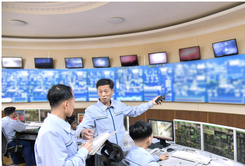
The Sangwon Cement Complex increases production.

Workers and technicians are producing products with high-quality indexes in full compliance with the technical requirements.