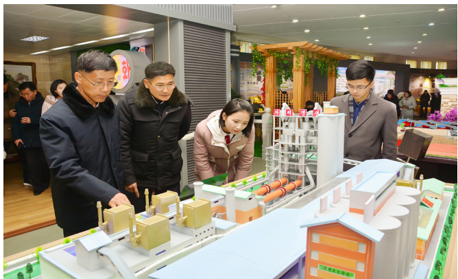
Visitors look round exhibits at the provincial building materials exhibition-2025.

The exhibition served as a significant occasion for showing the development potential of the regions and raising the production of the building materials in the country to a higher level.