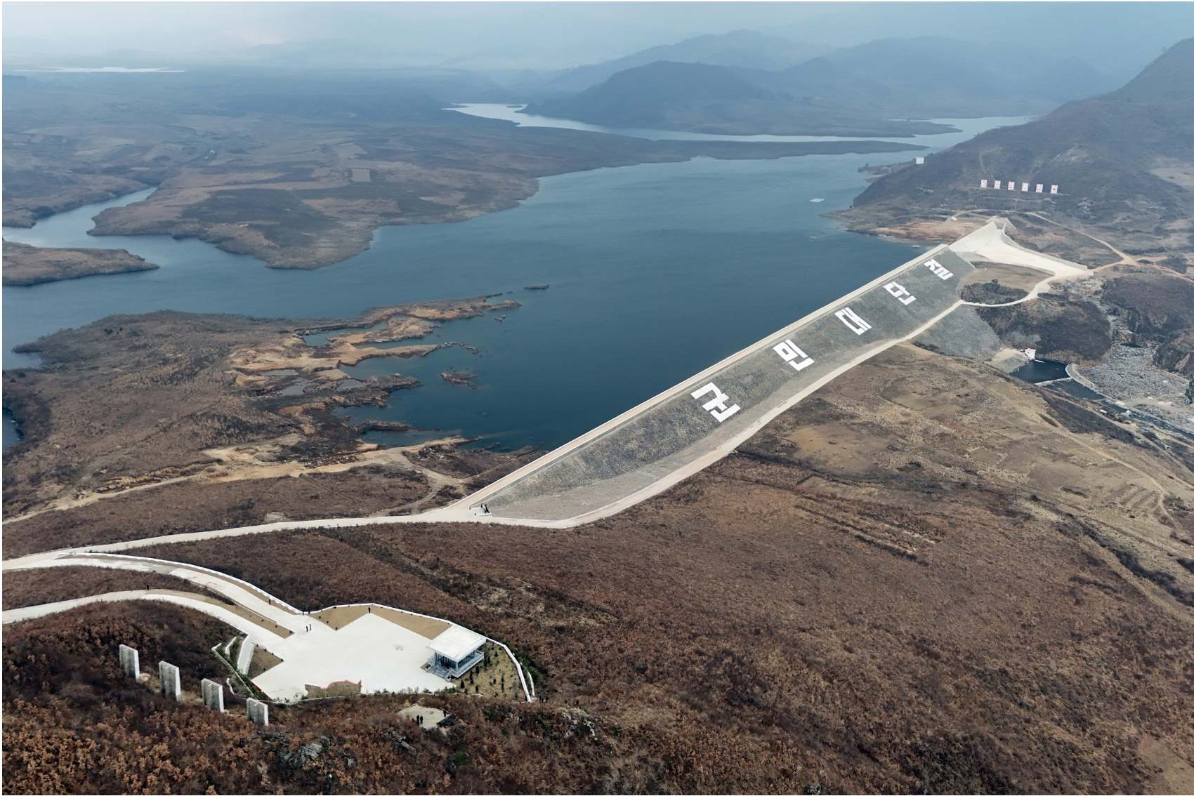
A bird's eye view of the Hoeyang Army-People Power Station built in Kangwon Province.

We are creators of the spirit of Kangwon Province, we must carry out the Party's policy without condition, no one can do it for us and we should carve out the path to happiness with our own efforts--with this viewpoint and attitude the people of Kangwon finally completed the construction of the six power stations.