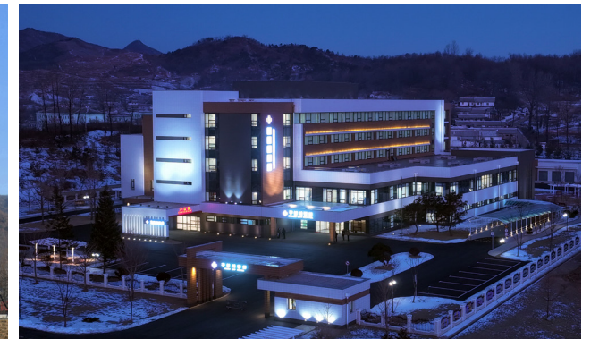
The Kusong City Hospital.

At the National Exhibition of Sci-tech Achievements in the Field of Public Health-2025, lots of medicines, medical appliances, health foods, sanitary goods and health IT products produced by many