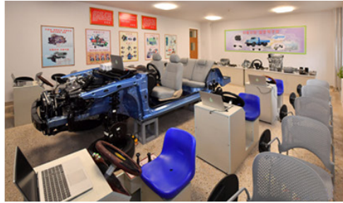
Driving practice room at Jonjin Senior Middle School in Rangnang District newly set up as an integrated school.