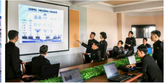
Discussion is intensified to improve the qualifications of rural school teachers at North Hamgyong Provincial Continuous Teachers Training School.