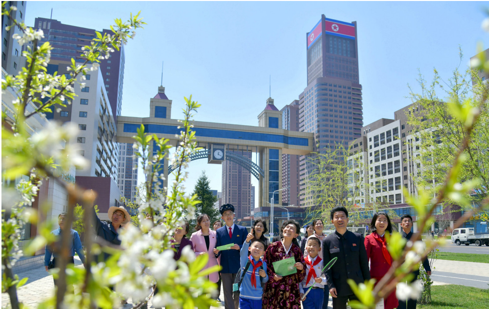
Ordinary working people and their families rejoice in receiving new flats free of charge.

and regional characteristics have been built in farming and fishermen's villages across the country and the news about working people moving into new houses has been reported all year round. For the flood victims who were left homeless in 2024 due to devastating natural disasters in North Phyongan, Jagang and Ryanggang provinces, the WPK built modern and cosy houses of all styles by completely removing the traces of flood damage. Lots of dreamlike stories have been produced as news about people moving into new houses have been reported in succession in recent years. In Munam-ri of Pujon County, a remote mountainous area, a family received a dozen licences for the use of houses on the same day and at the same time to the surprise of everyone and in Yonsan County a new house was already allocated to a "lucky couple" in a farm before their wedding. Looking at the dwelling houses rising up in succession, all the people of the DPRK say that it is the greatest happiness in the world for them to live in the embrace of the great motherly party.