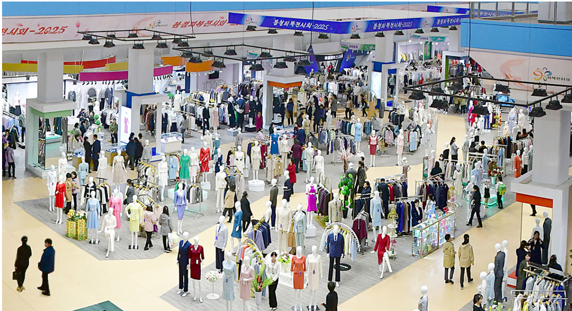
A snapshot of the Spring Clothes Show-2025.