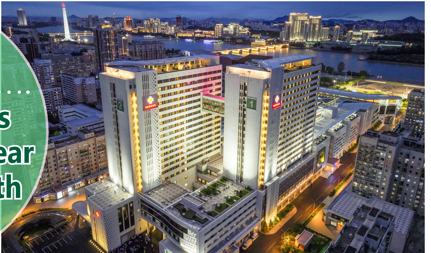
The Pyongyang General Hospital.