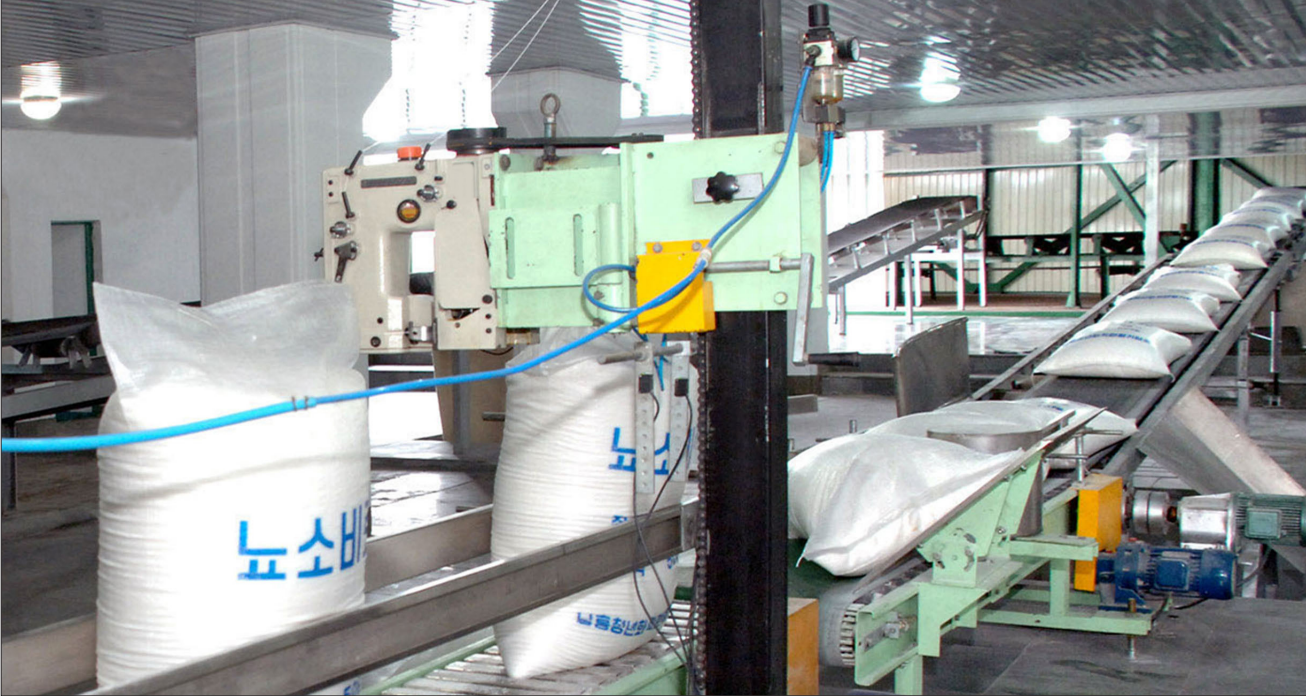
Bags of chemical fertilizer roll off the production line at the Namhung Youth Chemical Complex.

The author is department director of the Ministry of