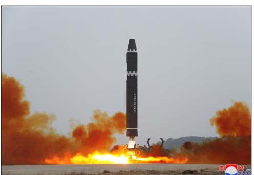
Hwasongpho-15 is launched at a high angle through the maximum range system at Pyongyang International Airport on February 18.

drill was conducted on the afternoon of February 18.