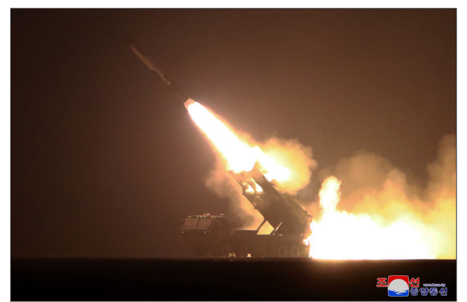
A strategic cruise missile launching drill is conducted at dawn of February 23.

Commission of the Workers' Party of Korea expressed great satisfaction over the results of the launching drill.