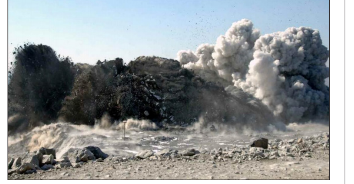
The Sunchon Limestone Mine conducts a 220 000cubic-metre blasting on February 21.

The mine fixed the efficient blasting area to ensure the present and future production in a balanced way and solved technical problems arising in securing more ore reserves through several rounds of consultative meetings.